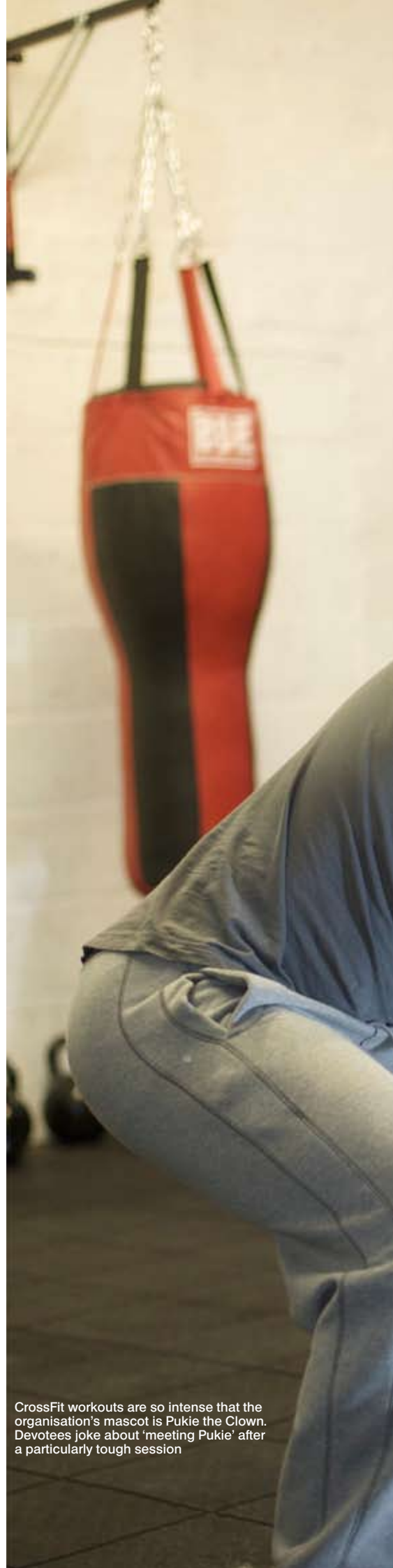
CrossFit workouts are so intense that the organisation's mascot is Pukie the Clown. Devotees joke about 'meeting Pukie' after a particularly tough session